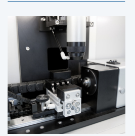
Laser Nozzle w. Product Axis